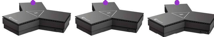
*Cables Included with Poly IP Table Microphone and TC8/TC10