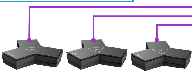
*Cables Included with Poly IP Table Microphone and TC8/TC10